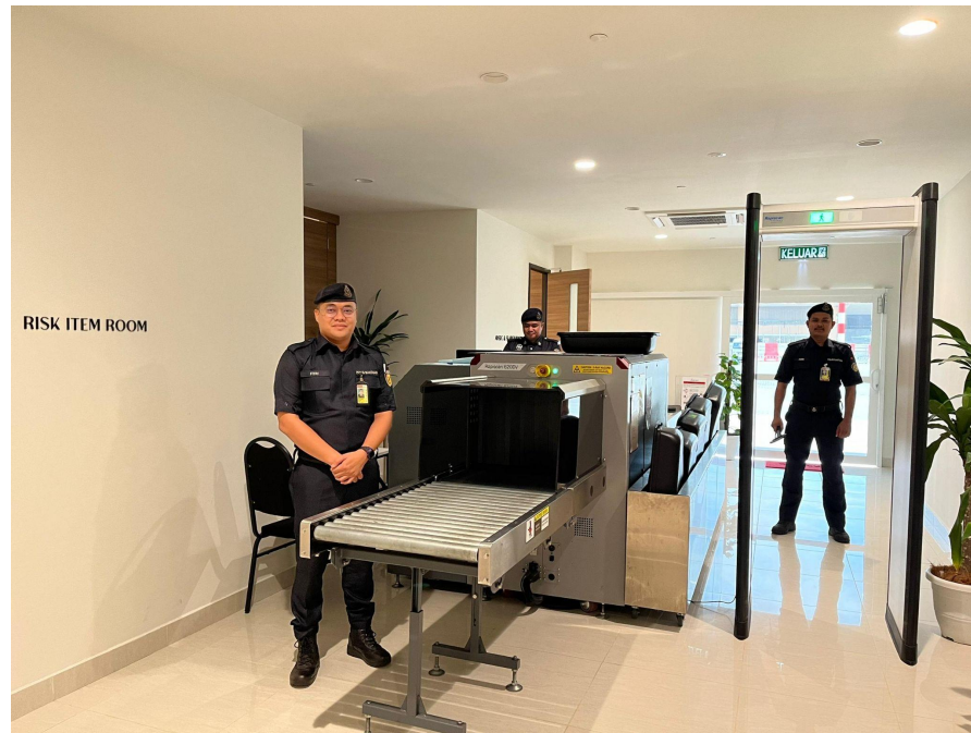
AVSEC Screening Centre