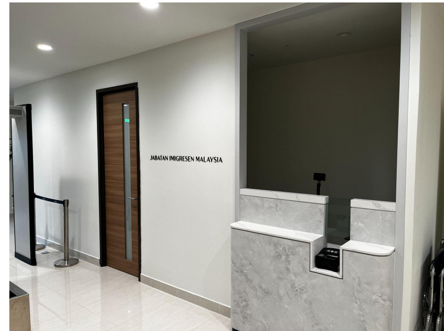
Immigration Counter in SBAC