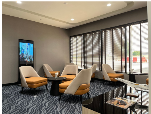
SBAC Common Lounge Area

SkyPark Business Aviation Centre ("SBAC")